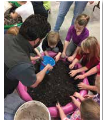
Naturalists at Linn County Conservation offer programs for adults and children, including school field trips throughout the year.