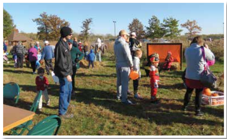
Wicked Wickiup Fall Fest